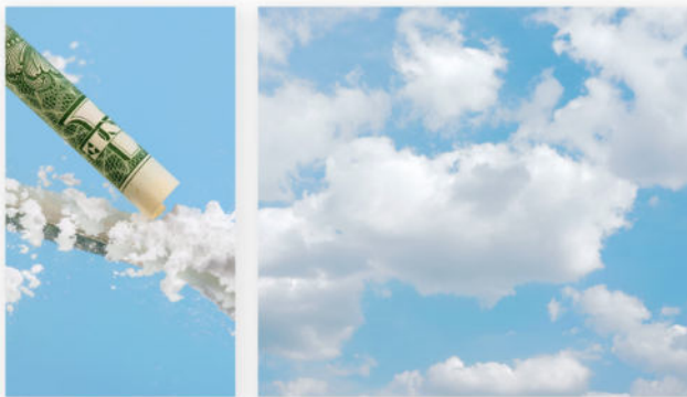
Hamburger Kunsthalle Viktoria Binschtok, Lines & Clouds , 2020, digital c-print, 117 x 69 cm / 117 x 130 cm.

The publication of press images in social media channels always requires the permission of the copyright holder.