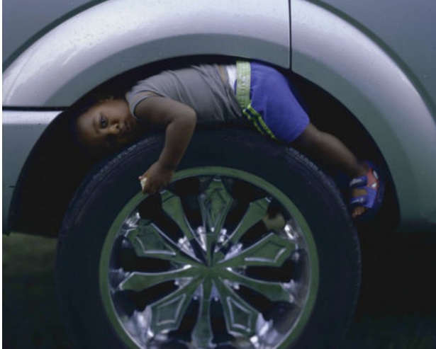
Deichtorhallen Hamburg: Hall for Contemporary Art RaMell Ross, Man (which is his nickname) , 2019, from the series South County, AL (a Hale County) , 2012-present © RaMell Ross.