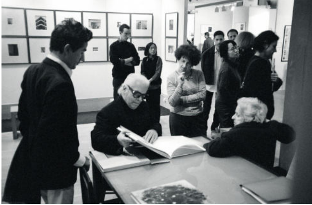
Deichtorhallen Hamburg: PHOXXI Denis Brudna, from the series: Paris Photo © Denis Brudna.