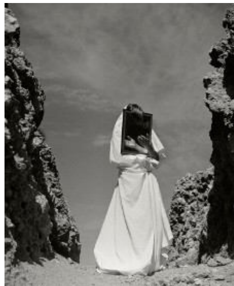
Bucerius Kunst Forum Herbert List, Ghost of Lykkabettos #1 , Athen 1937, Münchner Stadtmuseum, Photography Collection, Archive List