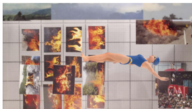
Hamburger Kunsthalle Sara Cwynar, Glass Life (Film-Still) , 2021, 6-channel video (2k) with sound, 19:02 min., variable dimensions

The publication of press images in social media channels always requires the permission of the copyright holder.