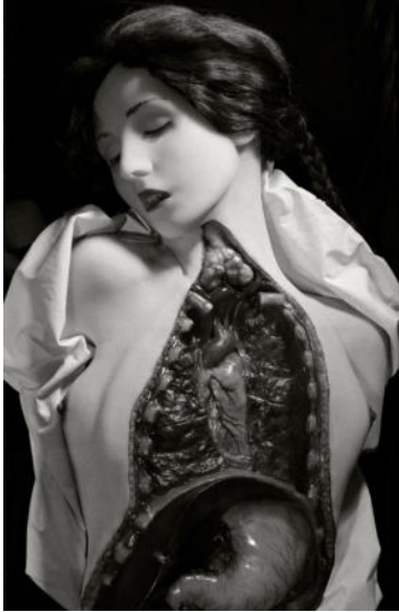
Museum für Kunst und Gewerbe Hamburg Herbert List, Instructive View into the Ribcage , 1944, Gelatin silver print, 296 x 191 mm, Herbert List Estate Hamburg