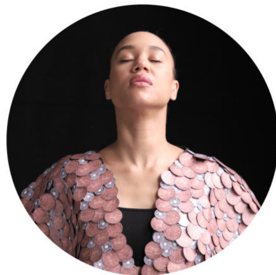
Museum für Hamburgische Geschichte Images from Macht. Mittel. Geld.