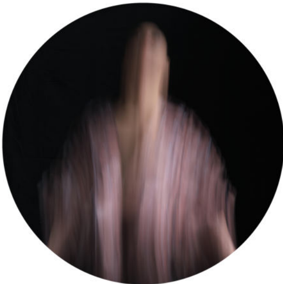
Museum für Hamburgische Geschichte Images from Macht. Mittel. Geld. © Chris Schwagga, SHMH-MHG (1).