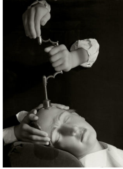
Museum für Kunst und Gewerbe Hamburg Herbert List, Trepanation , 1944/46, Gelatin Silver Print, 300 x 228 mm, Münchner Stadtmuseum © Magnum Photos / Herbert List Estate Hamburg.