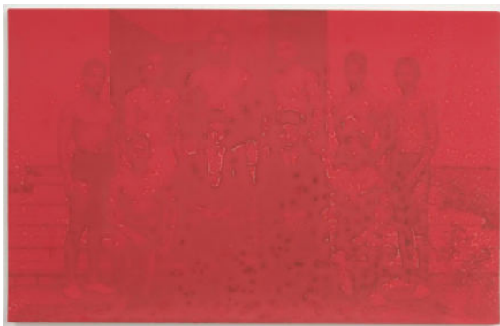
Deichtorhallen Hamburg: Hall for Contemporary Art Raed Yassin, The Company Of Silver Spectres , 2021, acrylic spray paint on vintage found photographs.

Reprinting of press images in media reports is permitted only and exclusively with coverage of the Triennial and the exhibitions involved. Precondition for the use free of charge is the consideration of the image credits mentioned below.